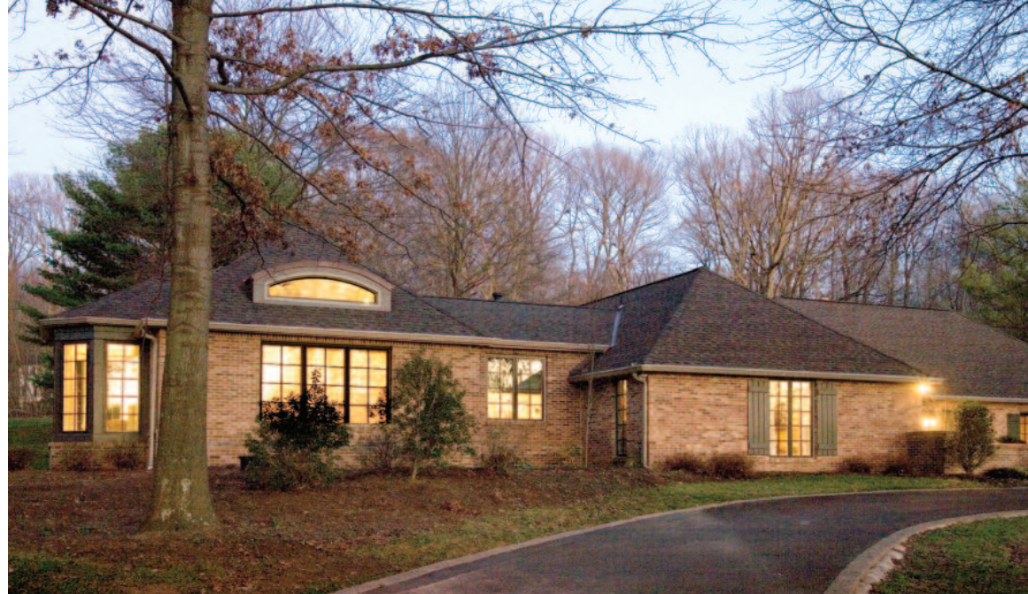
Matching the brick of the new addition to the existing house proved challenging, but worth the effort.