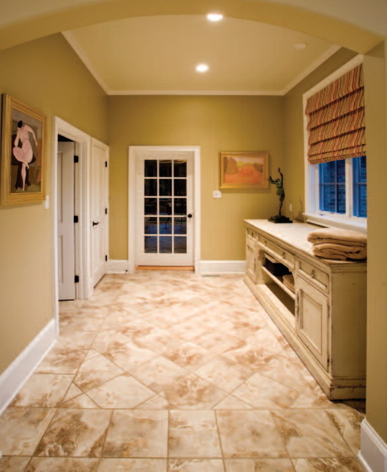
The neutral wall colors allowed the homeowners to decorate the addition with art.

grandchildren's safety in the room. To prevent a youngster from accidentally falling into the water, the contractors installed an automatic cover that opens with a key which completely seals off the pool. However, when the cover was in the rolled up position, it would be an eyesore. To solve the problem, the team used aluminum L-shaped beams to span the cover and build a beautiful raised panel bench seat with a hinged top, providing access to the cover motor and additional storage space. They also built a matching