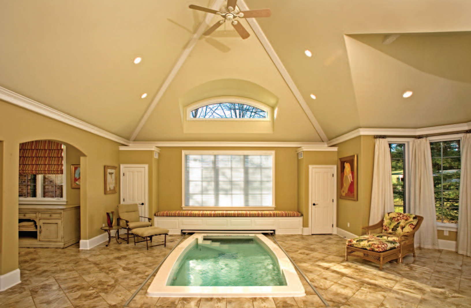
The whole design, especially the sweeping ceilings, gives the appearance of being outdoors.