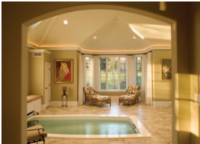
The homeowners love the way their pool room came together and enjoy spending time in the space.